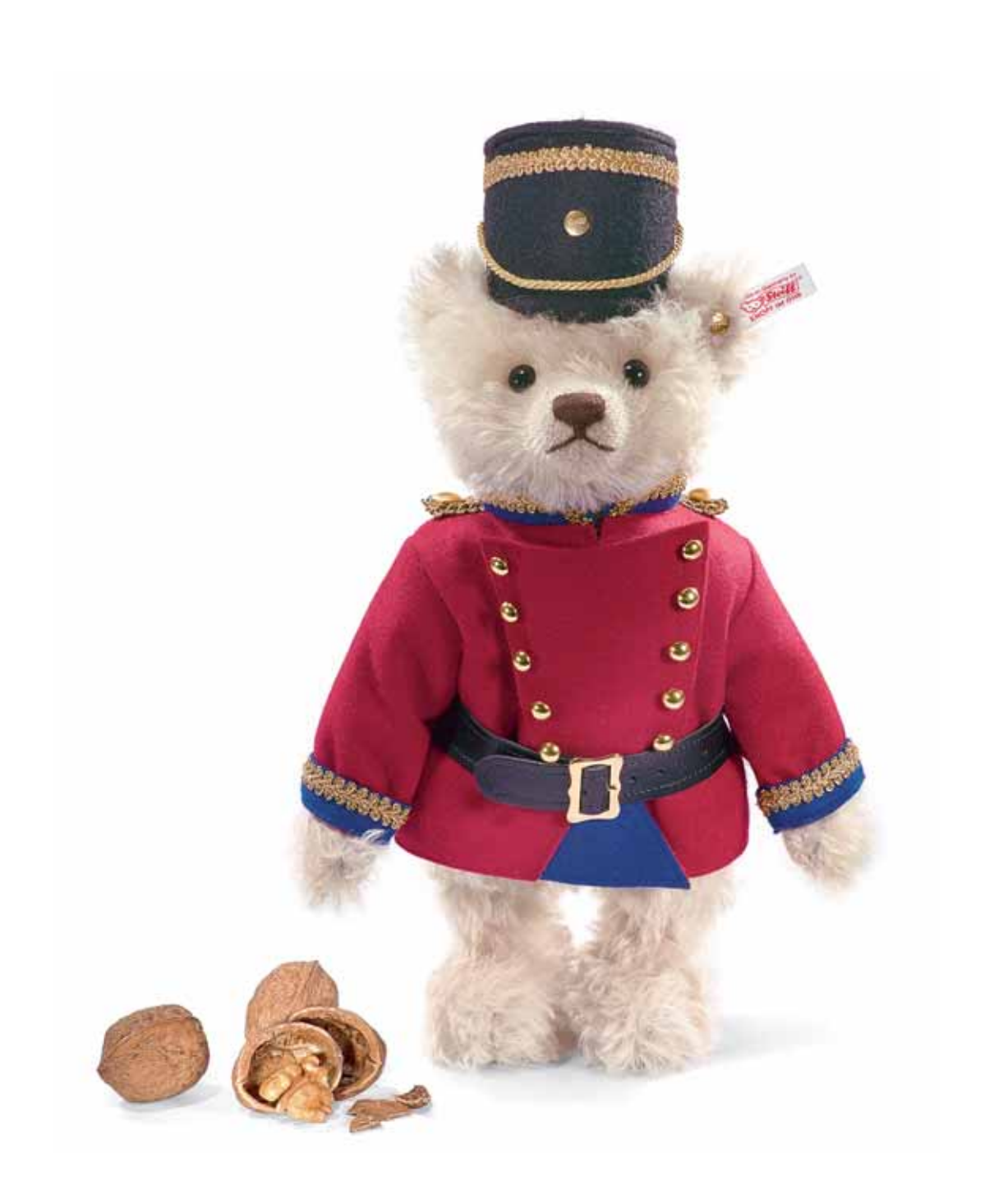
Christmas Special '08